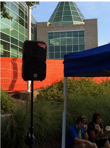
Active & Passive Speakers used, this is an Active Speaker

**If race is over two hours away from Moline, IL, hotel cost also needs to be included when picking this package. Usually another $150.00 dollars