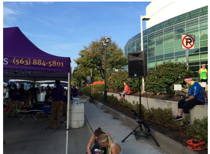
Active & Passive Speakers used, this is showing Both. (Marathon System)