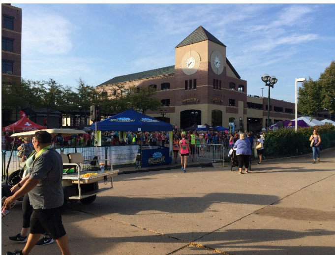
2016 Quad Cities Marathon 10 Speakers total for this race

**If race is over two hours away from Moline, IL, hotel cost also needs to be included when picking this package. Usually another $150.00 dollars